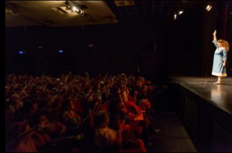
Opera Education, Pocket Opera Summer Festival, Mainstage Opera Season