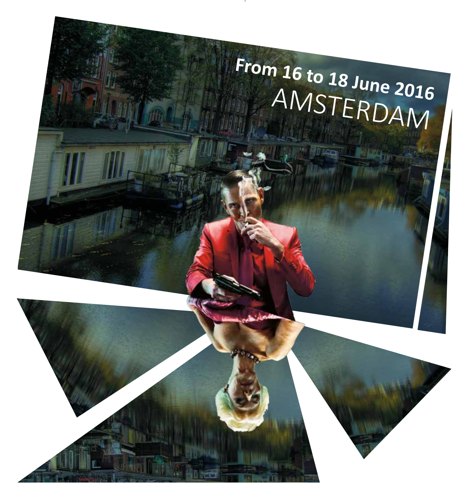
Theatre of the World

The professional association of opera houses and festivals in Europe De beroepsvereniging van operahuizen en festivals in Europa