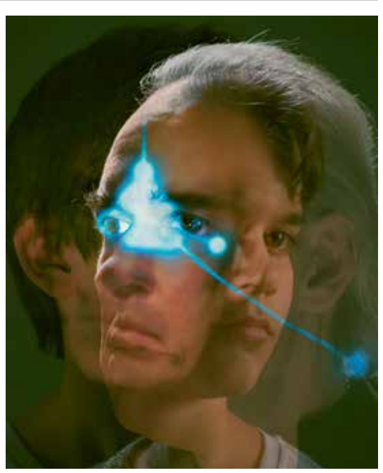
Theatre of the World © Petrovsky & Ramone

A more detailed and timed conference programme will be published later online and in the next newsletter at the beginning of June