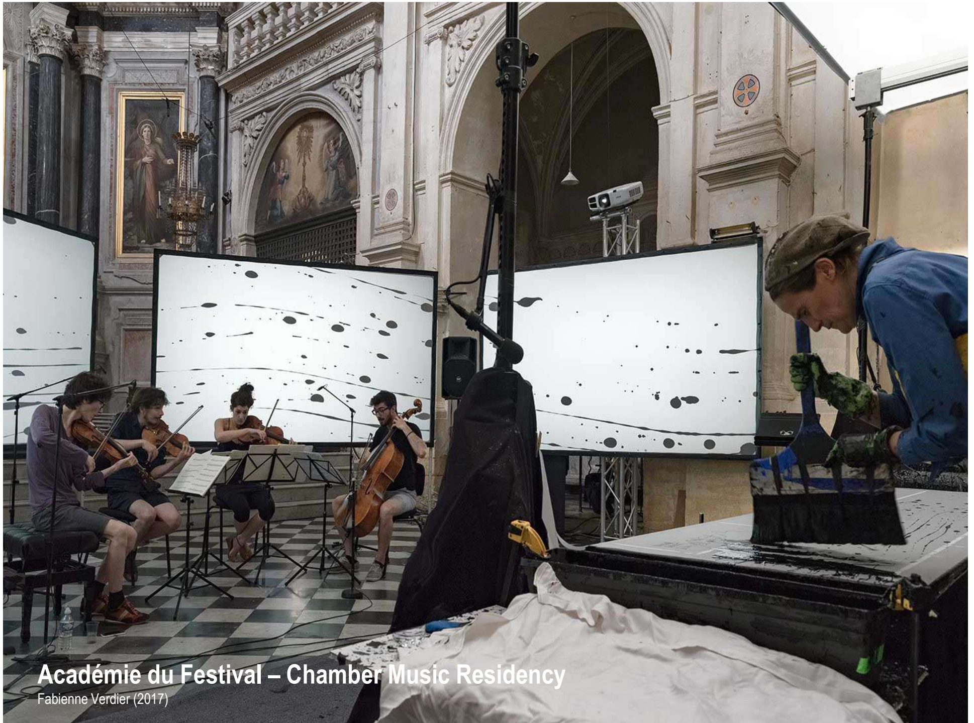
Académie du Festival – Chamber Music Residency Fabienne Verdier (2017)