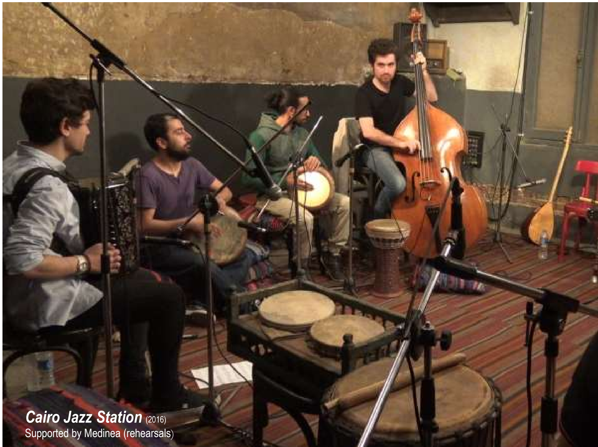
Cairo Jazz Station (2016) Supported by Medinea (rehearsals)