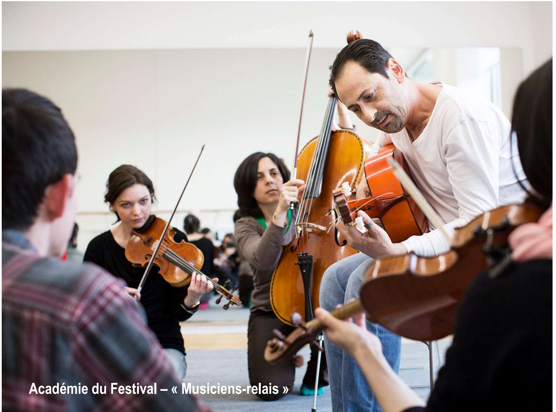
Académie du Festival – « Musiciens-relais »