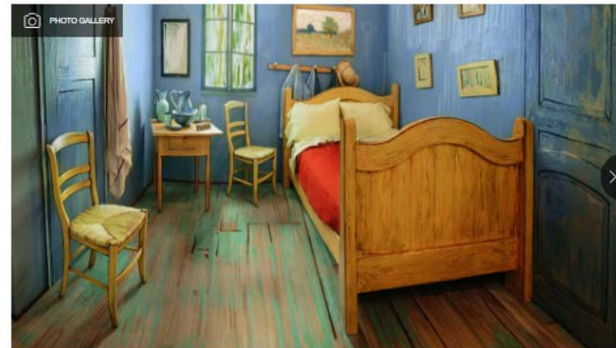
As part of the Art Institute of Chicago's new exhibit, "Van Gogh's Bedrooms," a replica has been created in River North of the bedroom featured in the artist's paintings. The bedroom is posted on Airbnb; guests can stay overnight.

By Corilyn Shropshire · Contact Reporter Chicago Tribune